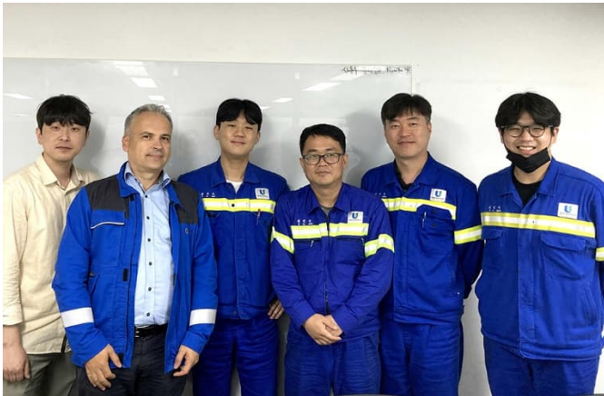
Representatives from Ulsan Aluminium and Primetals Technologies at the kick-off meeting in July 2024.