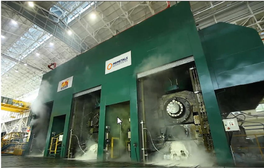
Primetals Technologies will upgrade the automation systems at Ulsan Aluminium's hot finishing mill.