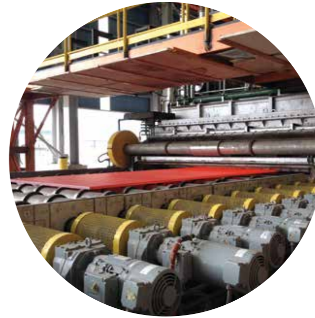
PLATE HEAT TREATMENT LINES COST EFFECTIVE - LOW OVERALL OWNERSHIP COSTS