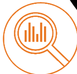
SCALE AND SURFACE MONITORING