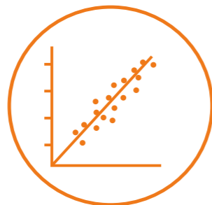
MECHANICAL PROPERTY PREDICTION