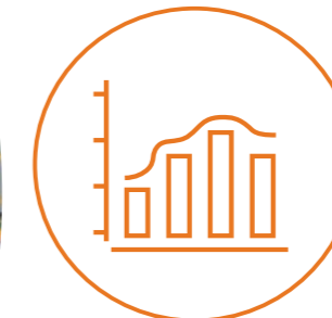
KNOWLEDGE BASED QUALITY REPORTING