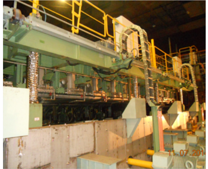
KOBE Steel MULPIC – Non-Pipework side