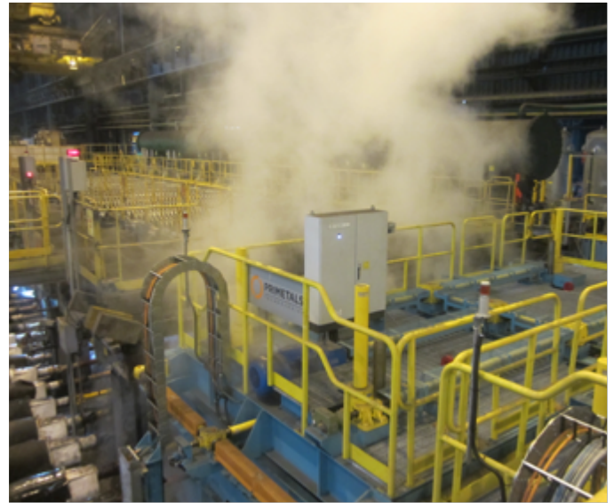
MULPIC Headers + Laminar Hybrid Cooling in action