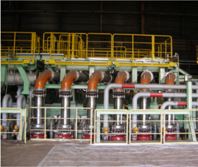
Mulpic® Cooling Technology