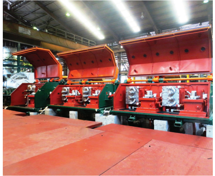
Modular rolling mills with H-V arrangement