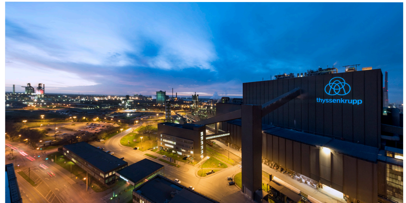
thyssenkrupp Steel Europe, Duisburg

“The interface between our upstream operations and hot strip production is a core element of our integrated production network. We are now making this area fit for the next generation. By separating and rebuilding the casting and rolling sections, we can further enhance our capabilities for high-strength steels and premium finishes. By splitting off the rolling section into a separate hot strip mill, we will also make our slab production more flexible.”