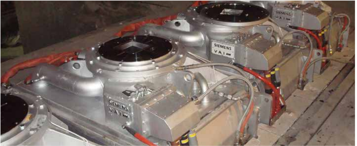
New caster machine head at Acciaierie di Calvisano, (Feralpi Group), Italy