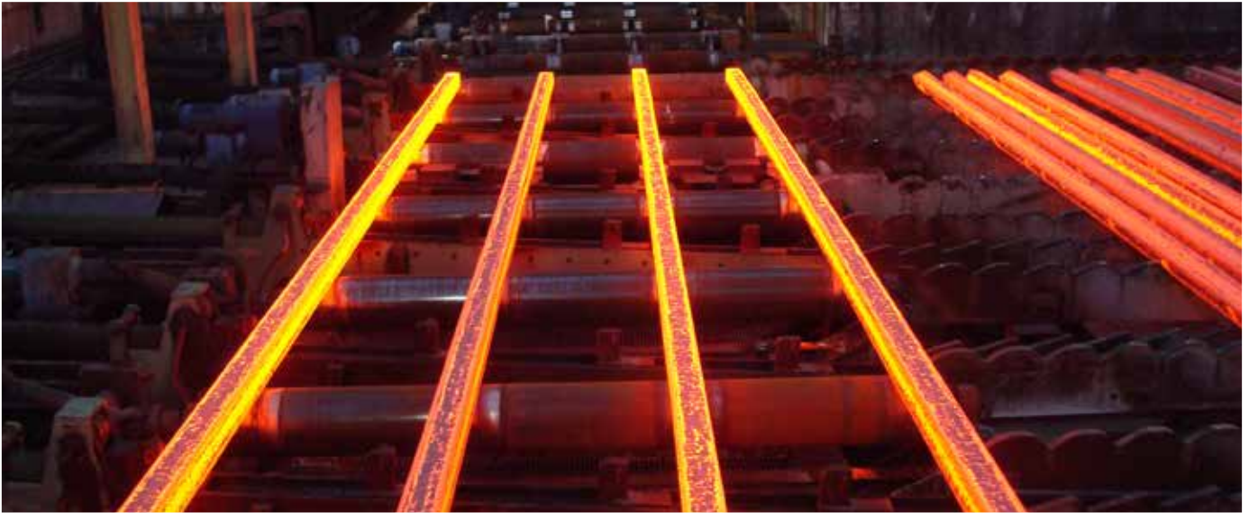
Modernized billet caster at Acciaierie di Calvisano, (Feralpi Group, Italy)