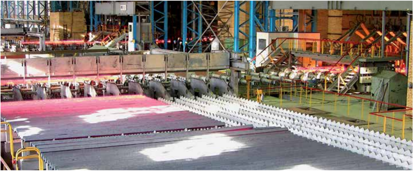
Two 5-strand billet casters, OAO Magnitogorsk, Russia