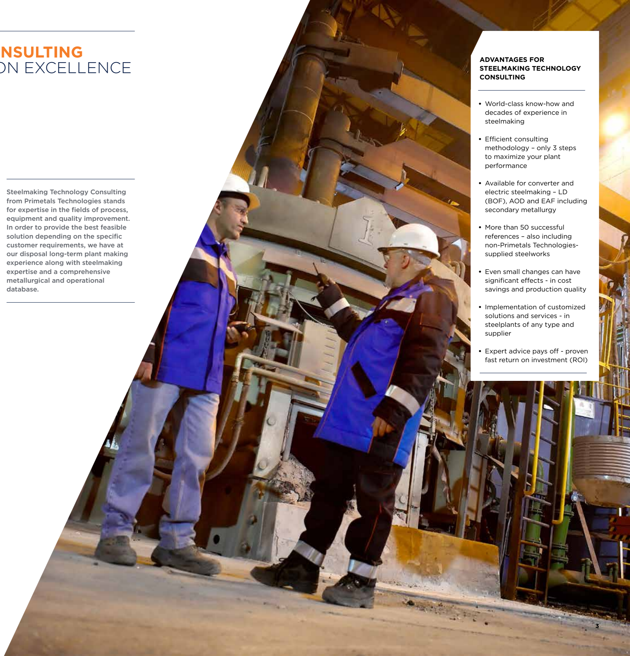
Steelmaking Technology Consulting by Primetals Technologies