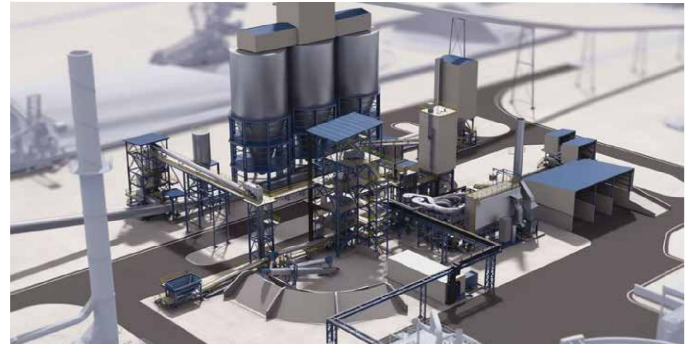
3D Model view of voestalpine Fines Recycling Plant

Primetals Technologies and voestalpine Texas LLC. collaborated and developed a project of a Fines Recycling Plant to be installed at the voestalpine HBI plant in Corpus Christi, Texas, USA.