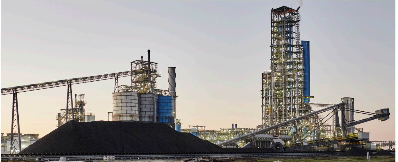
DRlpax DR Optimizer supports increased DR plant performance