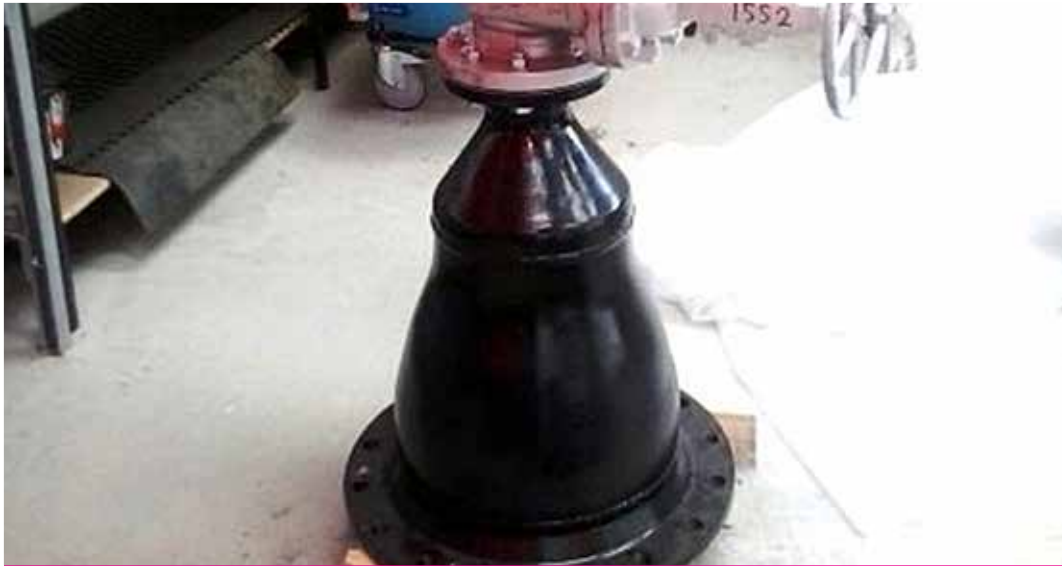
1 | Stockline radar recorder