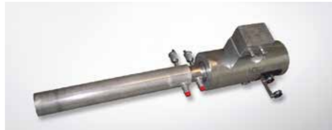
Lomas gas sample probe with cooling jacket