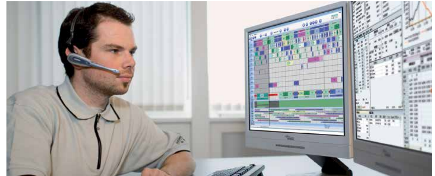
Automation support via remote connection

Remote sessions can only be initiated from the customer's end. This provides a reliable means of preventing unauthorized access to the customer's plant. Comprehensive logging of all activities ensures additional security.