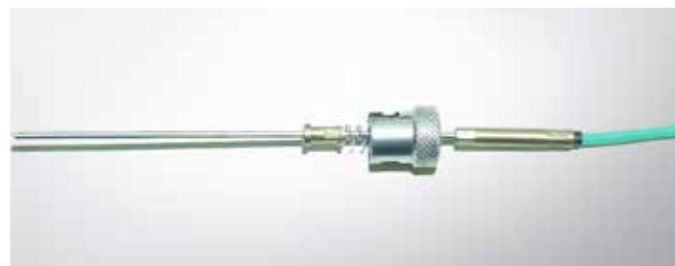
Thermocouple type K