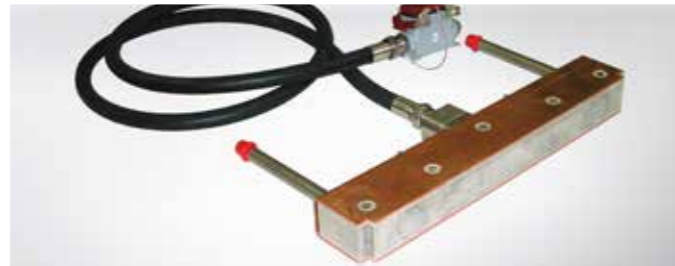
Mold level sensor