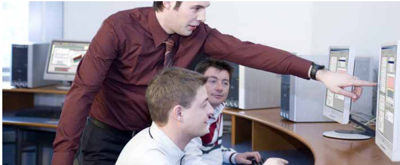
Training session at Primetals Technologies Linz

Primetals Technologies provides a full range of operational Consulting support to ensure that your electrical and automation systems operate at a constantly high performance level over the entire lifespan of your plant.