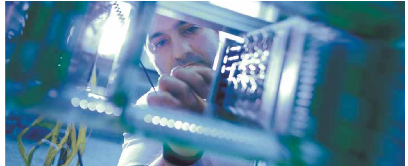
Component check in a PLC