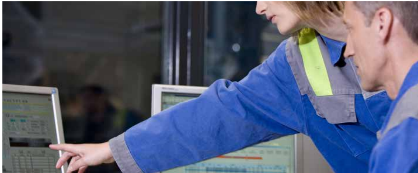
On-site services in the continuous casting control room, voestalpine Stahl GmbH, Linz, Austria

Primetals Technologies – where the most modern production technology meets the increased demand for product quality. Our worldwide experience in the area of electrical and automation systems provides our clients with innovative technological upgrades for their manufacturing equipment.