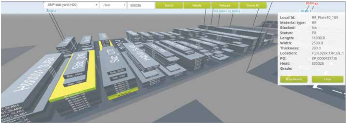
Primetals Technologies' Yard Management Solution offers 100% material location tracking and material identification.