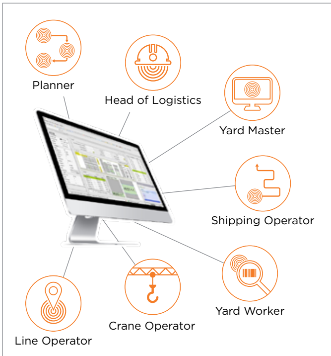
A lot of different job functions in a steel plant benefit from a smart yard management solution.