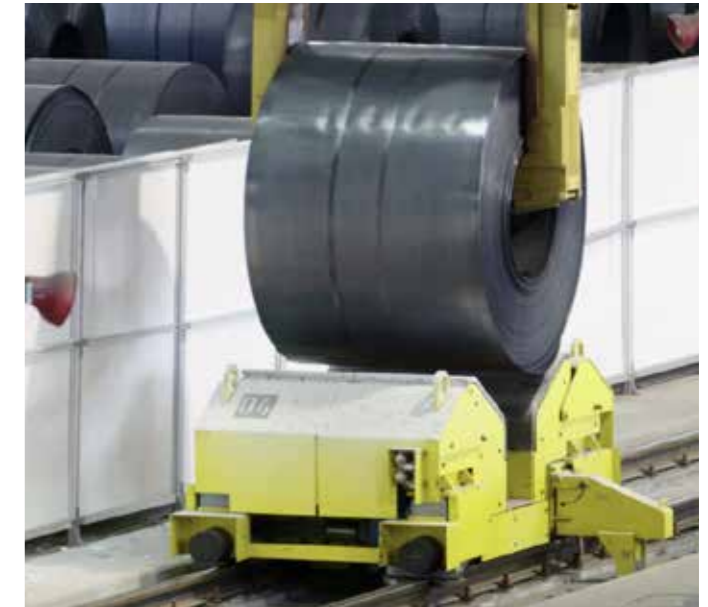
Unloading a Modular Coil Shuttle car by crane