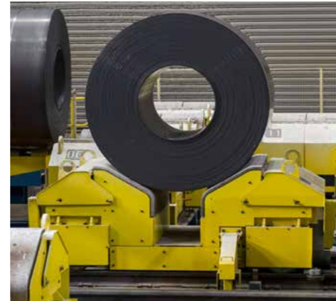
Modular Coil Shuttle car on a turntable