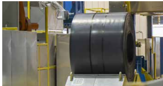
Coil identification is done by weighing and marking

At this station the coil is weighed and marked on its circumference and face side. The weight of the empty Modular Coil Shuttle car is known from the calibration weight taken at approximately every hundredth lap. The weight of the coil is determined by weighing the loaded car.