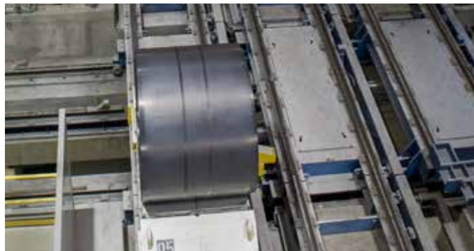
Removal of cars from the main transport line

The shifting station is used to remove a Modular Coil Shuttle car from the main track for coil inspection or maintenance, or to return an MCS car after coil inspection or maintenance to the main track. Up to three segments are shifted simultaneously (as one station) so that the main track is not interrupted after a car has been removed.