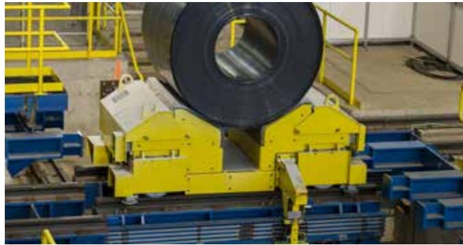
Lateral movement of the coil cars

The movable station is used to shift the loaded or unloaded Modular Coil Shuttle cars perpendicular to the main transport direction of the MCS car in order to facilitate lateral movements if the transfer route is changed. A movable station is, therefore, typically placed at the end of the transport system to ensure that the loop is closed.