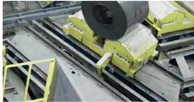
Change of direction for cross transfer

The turntable allows for a direction change of the Modular Coil Shuttle car of up to 90°, creating “T” and “L” shaped rail track connections. Depending on the layout of the coil transport area, the turntable is equipped with one or two rail segments.