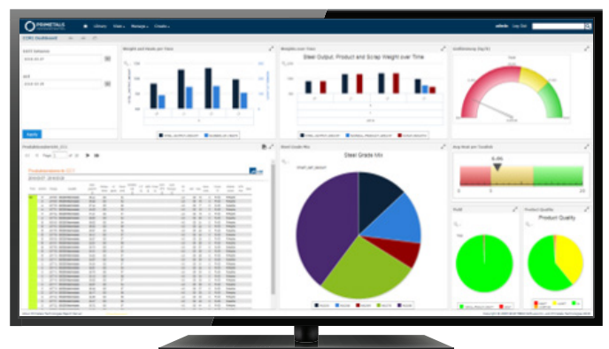
Example of Metals Business Intelligence human-machine interface.

The Metals Data Warehouse provides easy access to data prepared for big data applications. Data marts are subsets and structure the data for specific business applications as reporting, business intelligence and data analytics.