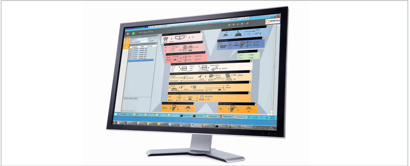
Plant overview HMI of VAiron Pelletizing Optimizer